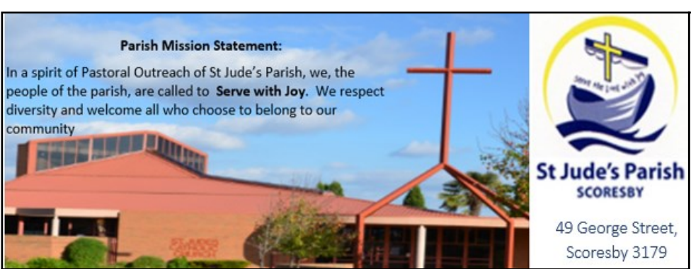
Fourth Sunday of Advent—Year B -24th Dec 2023